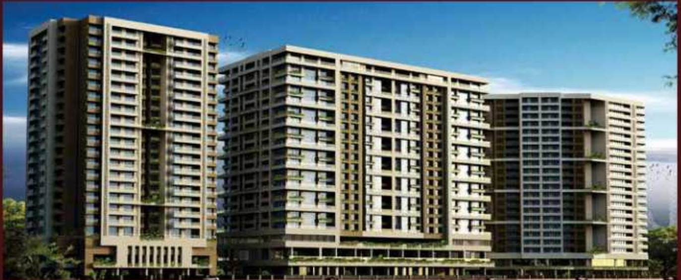
SIGNIA ISLES OC RECEIVED