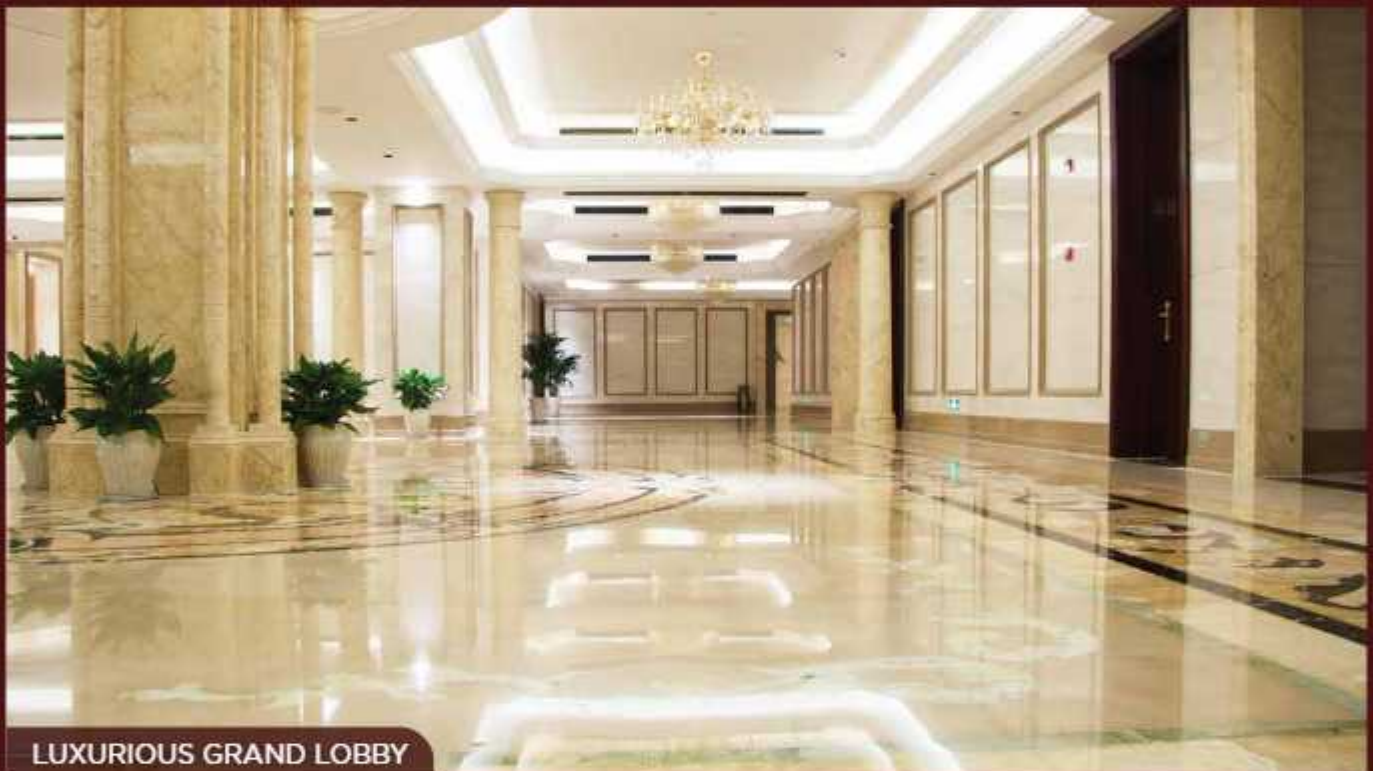
LUXURIOUS GRAND LOBBY