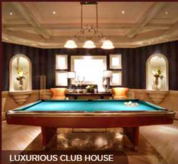
LUXURIOUS CLUB HOUSE